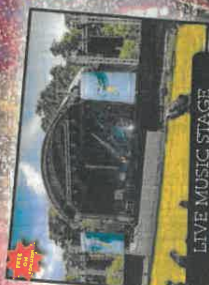
LIVE MUSIC STAGE