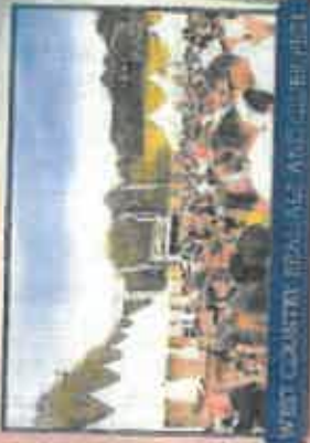
WEST COUNTRY SPACIAL AND LIGHTS