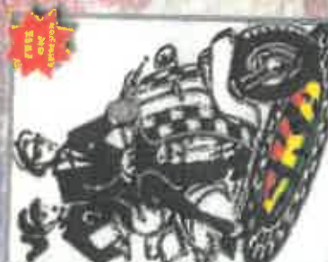
80'S SKA, SOUL AND REGGAE

DAILY GATE PRICE: ADULTS: £10 - CHILDREN: £10 (UNDER 12'S FREE) FOR SERVICES VISITING FROM 10.00 BRAMLEY SPORTS GROUND, GREEN ROAD, LONDON N14 4AB (TICKETS MUST BE BOOKED BY 1.00PM)