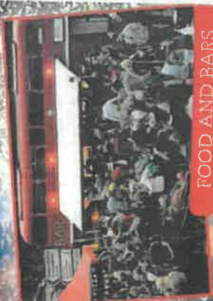
FOOD AND BARS