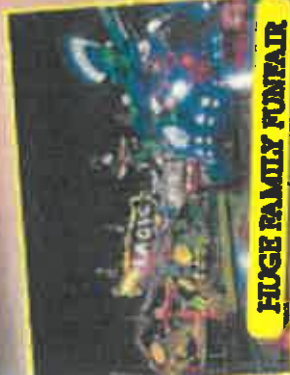
HUGE FAMILY FUNFAIR